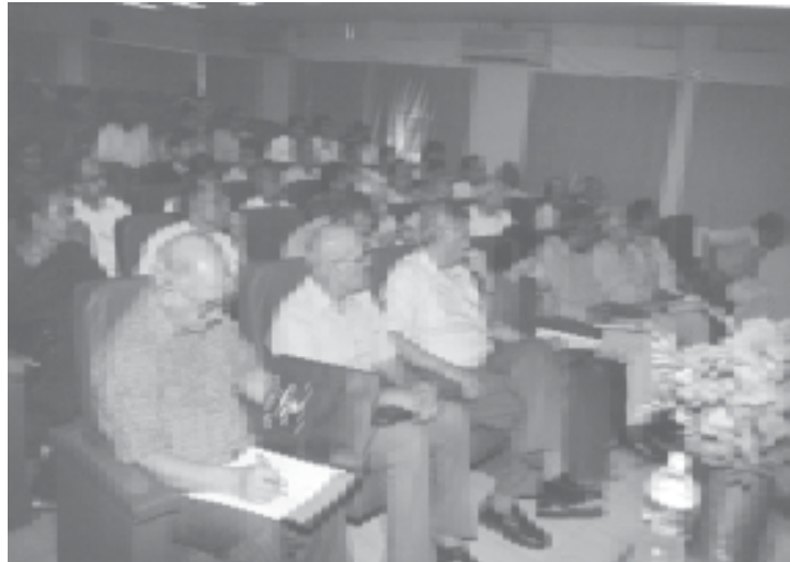
A view of the audience at the Seminar