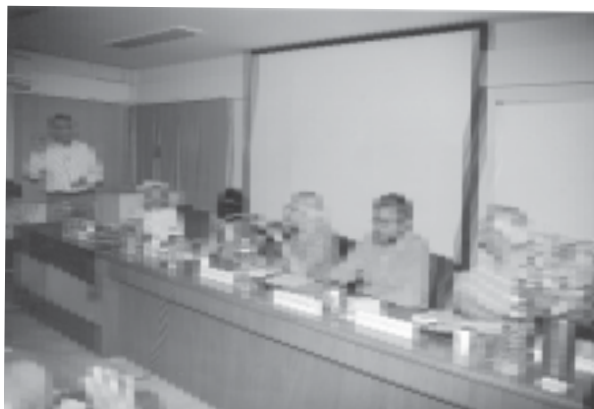
A view of the Panelists at the Seminar

is published in this issue of the bulletin. Senior Supreme Court lawyer - Mr. Prashant Bhushan - gave a talk on the accountability of a scientist to the society. In this context he expressed his views regarding the 'conflict of interest' of senior government functionaries when they get associated with other national and international agencies in some advisory capacity. He also mentioned that some very senior and elderly scientists, who occupy high positions, advocate projects that are highly ambitious but clearly impractical. This tendency has a potential of diverting meagre national resources into fruitless efforts and ultimately leads to frustration in the scientific community.